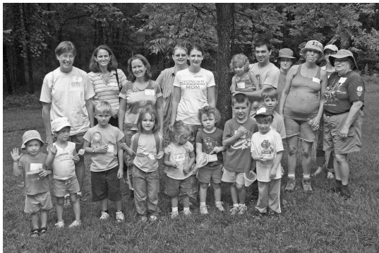
A Nature Detectives Program

Mail form and check to: P.O. Box 7642, Columbia MO, 65205 - 7642