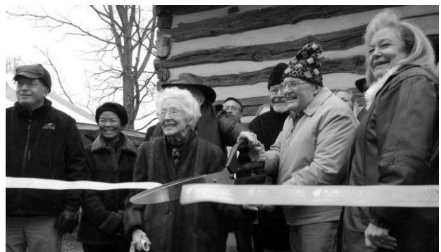
Ribbon cutting at the Hickam Cabin rededication