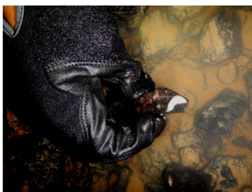
A large pink planarian (30 mm) moved on this rock held by a gloved hand

Every spring and fall, a team of park staff and volunteers enters Devil's Icebox Cave to check on the pink planarians and other animals that share their aquatic home. We call this our Pink Planarian Project or P3 for short. We visit three 5 meter survey plots where two surveyors kneel in the cold water, pick up each and every rock, identify and count the critters and call it off for the person recording the data. On 9-13-14, the total number of pink planarians was low (4), but the survey was not designed to determine total population numbers, rather to follow changes over time at these preferred habitat locations. The Pink Planarian is a species of flatworm that hasn't been found to live in any other location other than the Devil's Icebox Cave system. It has a brain, nervous system, both male and female sexual organs and is a predator in the cave ecosystem. While in the cave for the 9-13-14 P3 trip, we also observed about 3,000 gray bats, a spotted salamander, noticed erosion of mud embankments and beautiful calcite deposits.