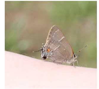
Juniper Hairstreak (above) and White M Hairstreak (below)