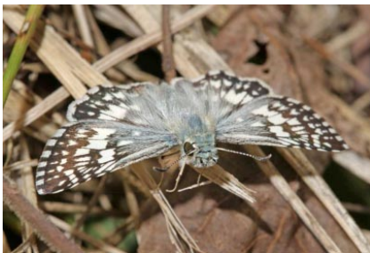
Checkered Skipper