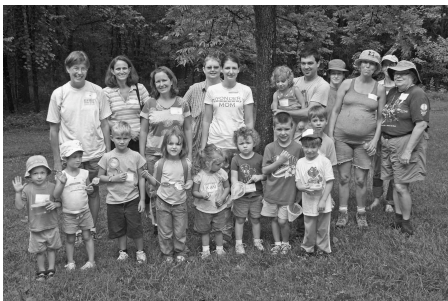
A Nature Detectives Program

Mail form and check to: P.O. Box 7642, Columbia MO, 65205 – 7642