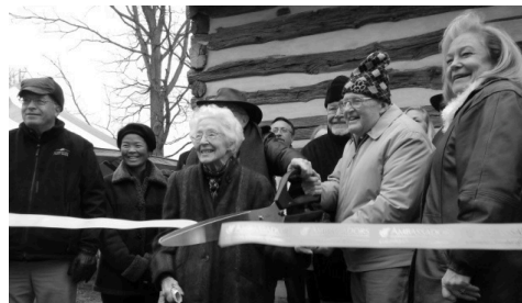
Ribbon cutting at the Hickam Cabin rededication